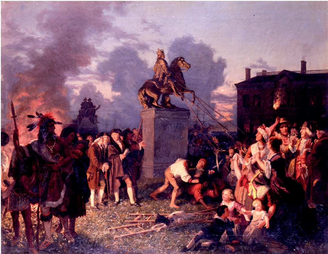
A painting showing the reactions of people in New York after the Declaration of Independence had been read out publicly, July 1776. The statue is of King George III.

At the beginning of the war Americans regarded the French as enemies of liberty, enslaved to a despotic king. Americans resented the high rank and money given to French men who came to America and served in the Continental Army. When General Rochambeau arrived in 1778, he established strict discipline and, thereafter, officers and men behaved with politeness and moderation. Not a single complaint was brought against them. Even those loyal to Britain could not help loving the French.